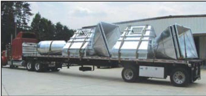
Your Custom Component's Transportation Needs Are Met With Ease

It sometimes takes up to five trailer loads to transport one of our fabrications – but, if we can build to these specifications, we can handle any special requirement.