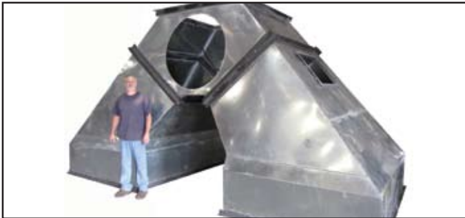
With US Duct, Size Does Not Matter